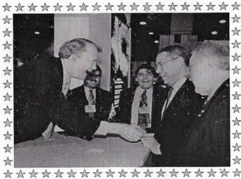
BUD DIETRICH ENTERTAINING GEN. COLIN POWELL